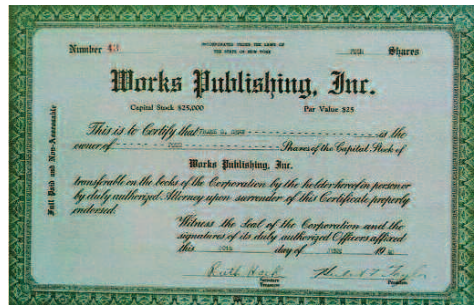
Copy of early share certificate in the Big Book

The uniqueness of our fellowship in maintaining its self supporting tradition is indeed miraculous given the heady days of AA and the scramble for money to print the big book.