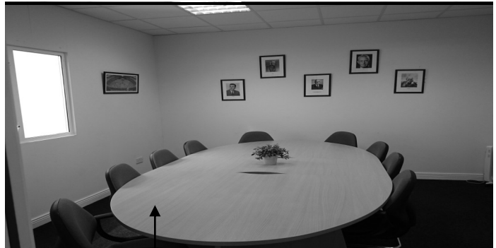
Board Room GSO