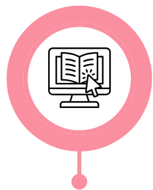
1. Developing PI resources & capacity

In the report sections outlined below, we will summarise our work in 2024 and give a flavour of our focus for 2025.