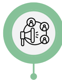
3. Media development